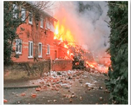
Bomb was planted by extreme groups exploded in Taplagung church

A radical Hindu priest shot himself in his arm with his followers and blamed Christians in Biratnagar, Nepal. His action resulted in riots and anger against believers. Later this person was convicted of the false accusation as they found he had made his friend do it. Extreme groups have created movements to threaten believers. Their goal is to bring back people to Hinduism. These radical groups have come to different places and taken evangelists and pastors to police custody. Seven people were arrested for evangelizing on the 10th of May in Taplejung. Three people were sent to police custody in Kathmandu for preaching the gospel last week. On May 11th the Indian prime-minister visited, three Hindu religious sites in Nepal and continues to promote Hinduism. He is very much a part of this persecution. On the 13th of May, there were bomb explosions in two different churches. Thank God, that no one was hurt! These are just the top of the iceberg of what is going on in Nepal right now. Believers are everyday choosing to take up their cross and follow the Lord. There are so many Hindu movements, violent actions and at least 15 people in police custody, because they preached the Gospel. Please be praying for Nepal.