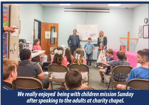
We really enjoyed being with children mission Sunday after speaking to the adults at charity chapel.