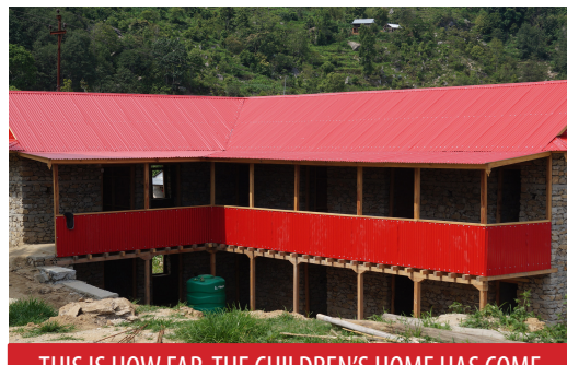
THIS IS HOW FAR THE CHILDREN'S HOME HAS COME. STILL LACKS WINDOWS, DOORS AND MORE