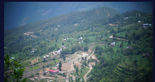
ASISH CHILDREN'S HOME IS THE HOUSE WITH THE RED ROOF