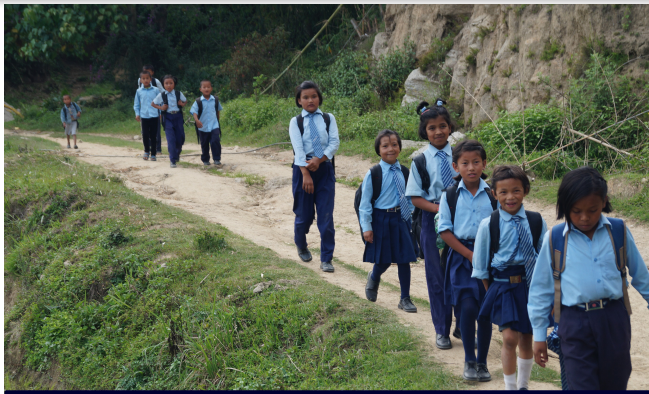
KIDS COMING FROM SCHOOL

Another great thing is that they have a government school and health clinic in the same village.