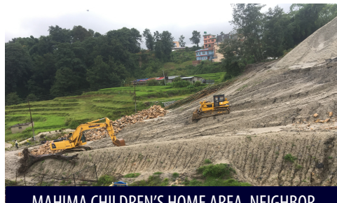
MAHIMA CHILDREN'S HOME AREA. NEIGHBOR PILING THE MUD AROUND