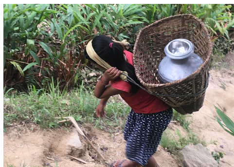
PERSON CARRYING WATER TO HER HOUSE