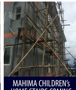
MAHIMA CHILDREN'S HOME STAIRS COMING ALONG