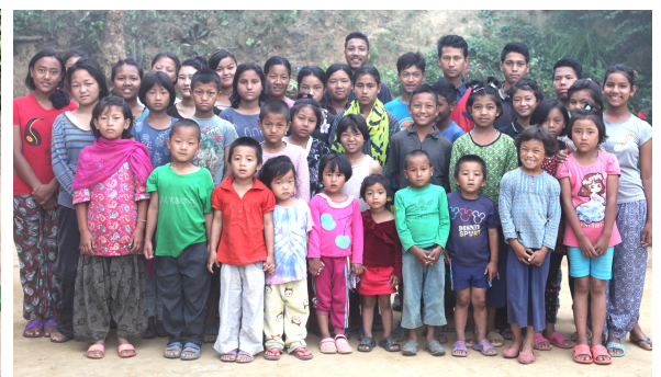
KID'S GROUP PICTURE