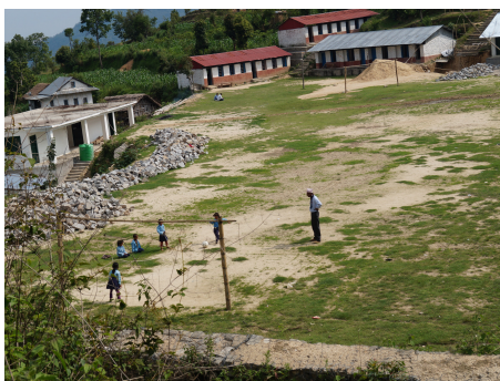
KID'S GOVERNMENT SCHOOL