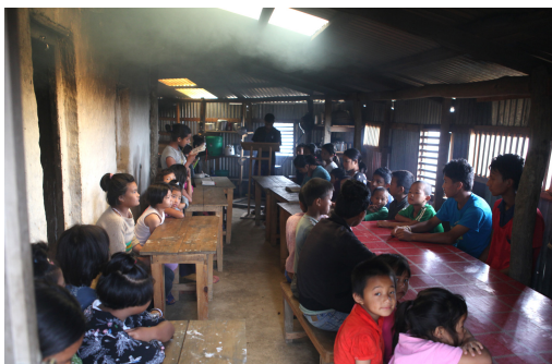
CHURCH FELLOWSHIP IN TEMPORARY KITCHEN