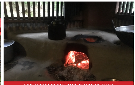
FIRE WOOD PLACE. THIS IS WHERE THEY COOK THE FOOD