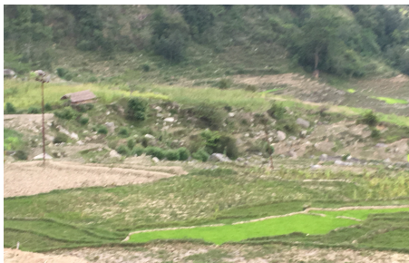
NEW PROPERTY CHILDREN'S HOME NEEDS!