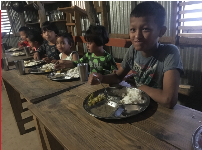
KIDS EATING DINNER

I recently travelled to Bhojpur to see how they were doing. The kids looked happy and excited and the atmosphere there is so much better for them. The girl's hostel is almost completed as some funds were donated to Asish children's home for that. Now they need a boys' house and kitchen next. We are hoping to get the neighbouring property for $5000, where the boy's home and kitchen can be built. We are very excited to see Asish Children's Home be established and for these children to have a good and safe place to grow up. Thank you again for supporting these children!