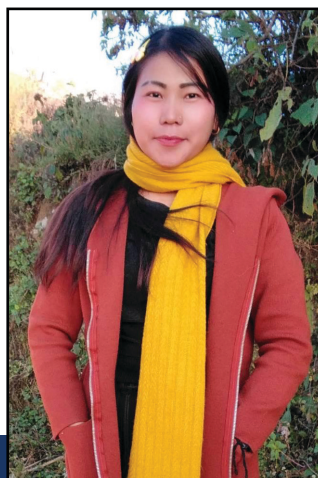
Prtit is also studying