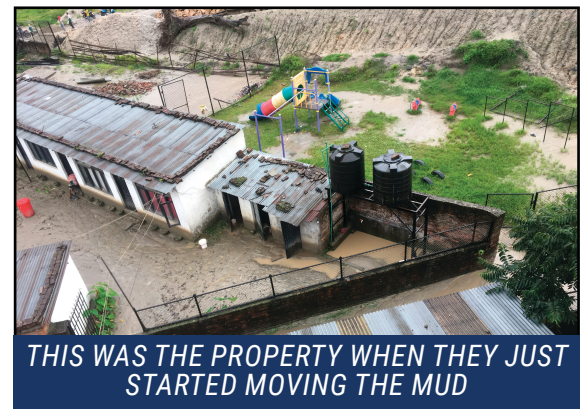
THIS WAS THE PROPERTY WHEN THEY JUST STARTED MOVING THE MUD

Do you remember how the property around the children's home looked last summer? I have talked about our neighbor pulling the mud and piling as high as 10-15 feet next to our fence. We have asked over and over again that they must stop moving the dirt, and breaking our boundaries. I have taken this issue to the municipality because of the flooding on our property. Instead of receiving help, I am accused of converting children to Christianity, and I am told that they want to close down our church there. The government does not want our children to participate in any Christian activities. In Nepal, believers are looked down upon because it is considered a betrayal of Hindusim and followers of Western religion.