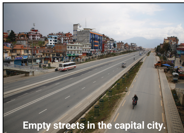
Empty streets in the capital city.

Nepal is going through the complete lockdown as like many other countries. It was done without any warning and people did not get a chance to store up food. There have been several cases of corona and some people have died. I am praying that it will not last long. Schools are closed and Nepal is not at all prepared for an epidemic. The airport is also closed, so I cannot get to Nepal right now. Many of our believers work and eat. They have no extra food storage or savings account. We are trying to find ways that we can help them and make sure everyone has everything they need. Please keep kids, elderly, church believers and the people in Nepal in your prayer.