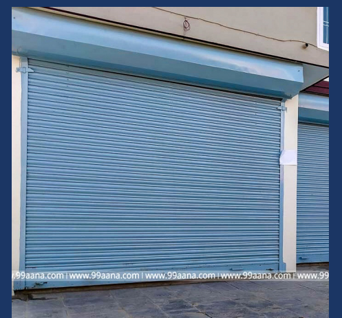
Purpose shutter for grocery shop