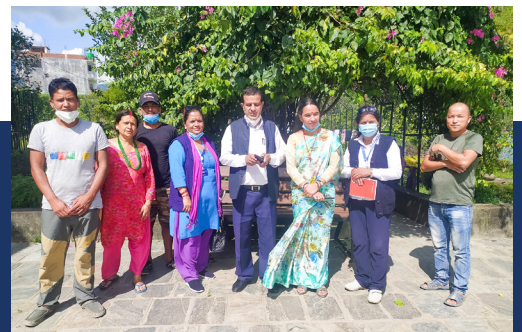
Recent visit of deputy mayor of Tarkeshower