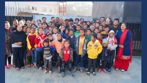
Children from Mahima Children's home