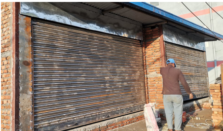
Brick walls, tin roof and front shutter are placed. Next move will be to plaster, paint, and fix electricity

In 2021, we will plant five new churches in the area of the unreached people groups of Nepal. We have 120 tribes and languages, so there is still a lot of ground to cover!