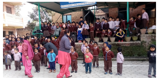
Most of our kids attend this (Manmaiju) school