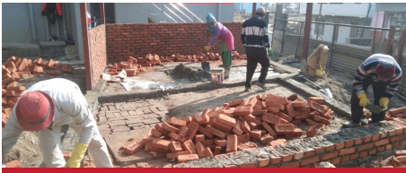
Foundation for shutter is finished and moving forward with wall

Church planting update: In the year 2020, four churches were built. 71 people were baptized last year and an additional church was planted in the area for the Thami language. This is close to the Tibetan border. We believe that God wants every tongue and people group to hear the gospel, so this is our goal!