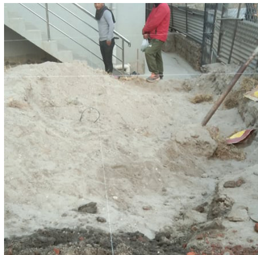
Putting the rope for digging the foundation for the two room shops