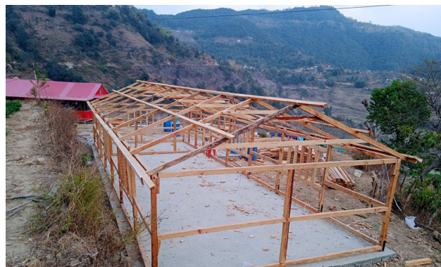
Two years ago, we got a new property for a second children's home at Bhojpur. We are in the process of construction on the church!