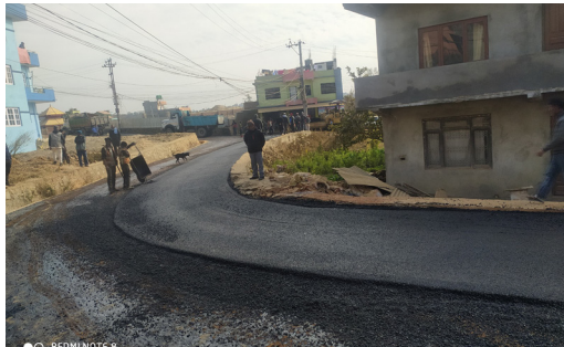
Road to Mahima Children's Home is fixed! They have put black asphalt!

The two-room shop construction continues while I write to you. The goal is to have a little shop for children's homes to get the food such as rice, lentils, beans, dry noodles, etc., at a fair price, even when there are unforeseen events. The foundation, wall, and roof are finished and it looks great! The next step is to cement plaster around the wall, put paint and fix electricity. This might also give some work experience for the older children. School is back to normal again in Nepal, so the children go to school every day.