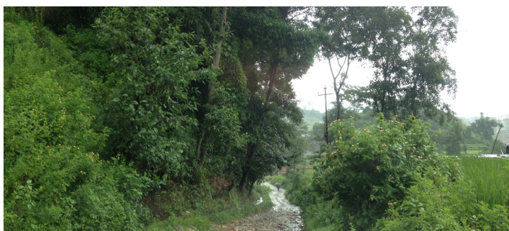
This is how the Mahima Children's Home road looked until two years ago.