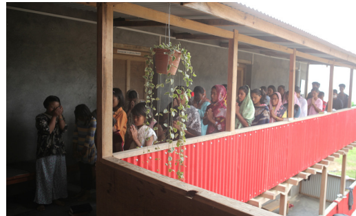
Second children's home. They are having fellowship on the balcony!