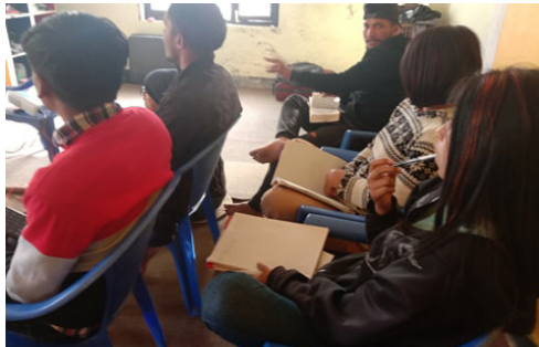
Students joining online classes from Phutung