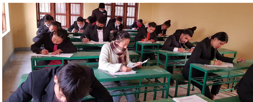
Schools have started again and this is Manmaju school grade 11