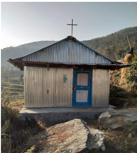
Newly built church at Bhote Chagu Dolakha