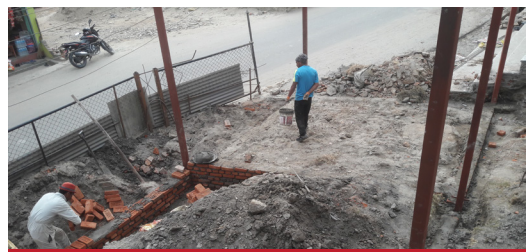
Installing the iron poles for stronger support of the side walls!