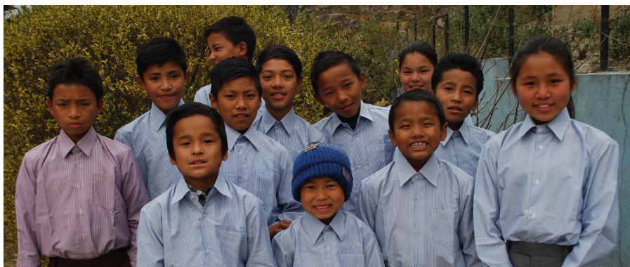
We are sending kids to 3 different schools. Most of them go to Manmaju school and some go to Phutung school. These are children in their new outfits to the Phutung schools and a few private schools.