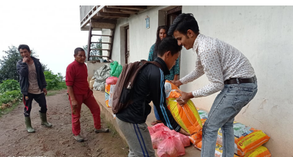
Distribution of food to the people in Dolakha