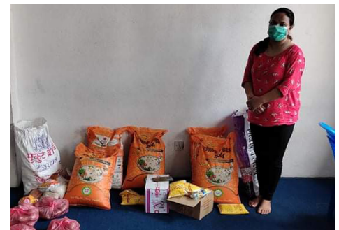
Churches have stored food for the people who need it the most