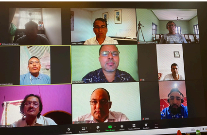
Zoom has been a blessing to connect with leaders

Some of our dear friends have been released from the hospital and are finally catching up with everyday life again. Thank you so much for all your prayers for friends and family.