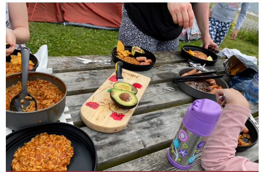
Enjoying our dinner!