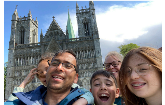
Nidarosdomen in Trondheim in the background