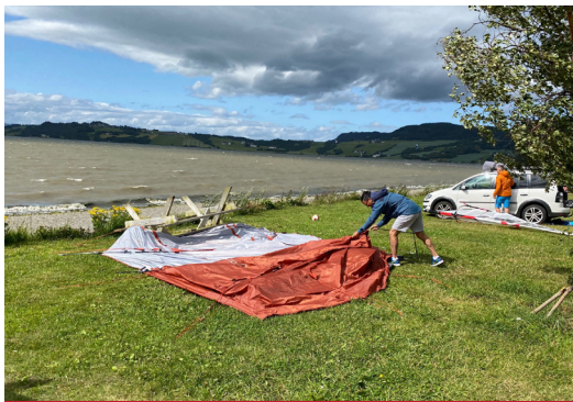
Saving the tent