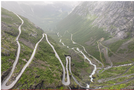
Mountains in the rain