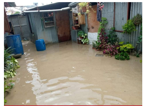
Outside the church