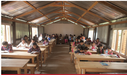
New tables and benches in second children's home

talk to the children that grew up at the children's home that are doing well now. They are finding their path in life and through your help we were able to give these children a future. That is amazing!