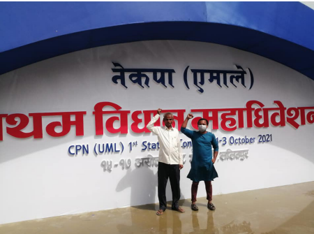
Imam in blue dress

Our online zoom classes for school of ministry are continuing. Thank you for your prayers. As the scripture says: the one neither who plants nor the one who waters is anything, but only God, who makes things grow. 1 Corinthians 3:7. We are so grateful for what God is doing through your gifts and prayers.