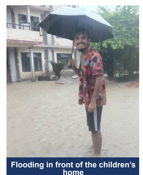
Continuous monsoon rain flowing from our pathway!

However, this summer we had a new turn of events when the mayor released the funds for the local government to build a drainage and save our building. We have already spent a lot of funds to build drainages, but it has not been enough, and the water has always found new ways of returning to the children's home property since the neighbors keep elevating their own properties.