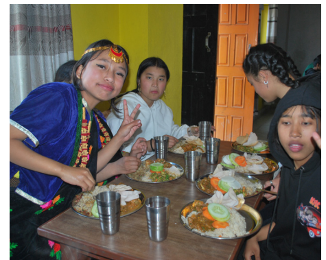
Dinner at christmas day