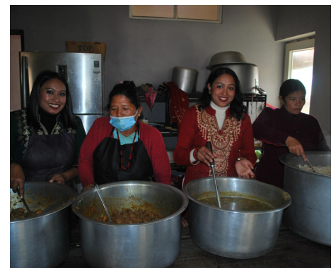
Serving Dinner at children home at Christmas day