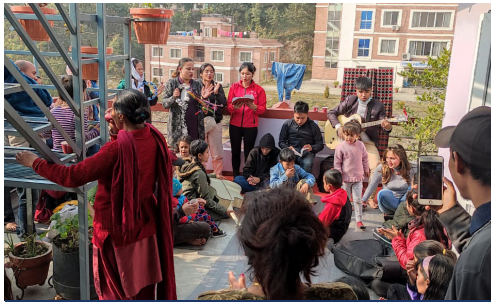
Fellowship at Mhepy Church

Christmas update at children's homes: There is excitement and joy in the eyes of kids and staff at Christmas. Kids are waiting for good food, winter clothes, gospel message of Jesus' birth, fellowship and individual gifts and it is always great to see smiles on their faces. Thank you for making it possible during the Christmas season. It really makes such a huge difference for our children!