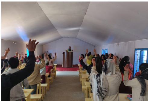
Fellowship at second children's home