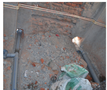
Plumber work at children home