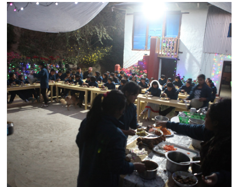
Christmas dinner at second children's home