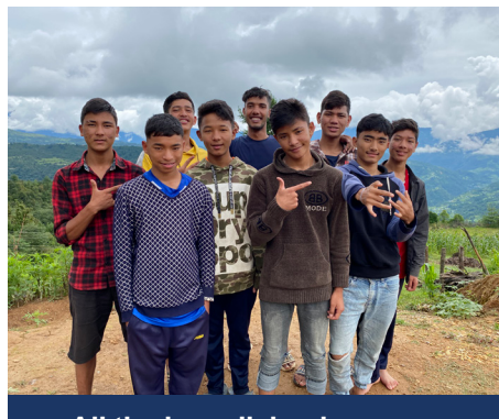
All the boys living here now

We cannot express enough how much we appreciate your unwavering support through your generous contribution. Your contributions enable us to make a lasting impact on the lives of these children, giving them hope, education, and a chance for a better future. Please know that every single donation matters and makes a significant difference in their lives. Together, we can make a lasting impact on these children and the entire community surrounding our new children's home in Jiri. Through your gifts, you are directly contributing to the growth and prosperity of these children, as well as the bigger mission; to reach out to the Tibetan people groups and share the good news with them.