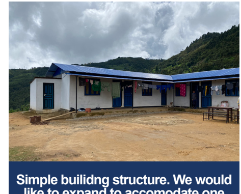
Simple builidng structure. We would like to expand to accomodate one more family